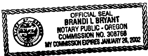
Notary Public for Oregon