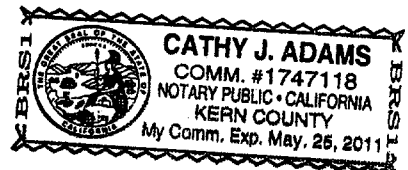
EXHIBIT NO. A