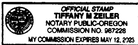
Notary Public for Oregon

THE PROPERTY DESCRIBED IN THIS INSTRUMENT MAY NOT BE WITHIN A FIRE PROTECTION DISTRICT PROTECTING STRUCTURES. THE PROPERTY IS SUBJECT TO LAND USE LAWS AND REGULATIONS THAT, IN FARM OR FOREST ZONES, MAY NOT AUTHORIZE CONSTRUCTION OR SITING OF A RESIDENCE AND THAT LIMIT LAWSUITS AGAINST FARMING OR FOREST PRACTICES, AS DEFINED IN ORS 30.930, IN ALL ZONES. BEFORE SIGNING OR ACCEPTING THIS INSTRUMENT, THE PERSON TRANSFERRING FEE TITLE SHOULD INQUIRE ABOUT THE PERSON'S RIGHTS, IF ANY, UNDER ORS 195.300, 195.301 AND 195.305 TO 195.336 AND SECTIONS 5 TO 11, CHAPTER 424, OREGON LAWS 2007. BEFORE SIGNING OR ACCEPTING THIS INSTRUMENT, THE PERSON ACQUIRING FEE TITLE TO THE PROPERTY SHOULD CHECK WITH THE APPROPRIATE CITY OR COUNTY PLANNING DEPARTMENT TO VERIFY THAT THE UNIT OF LAND BEING TRANSFERRED IS A LAWFULLY ESTABLISHED LOT OR PARCEL, AS DEFINED IN ORS 92.010 OR 215.010, TO VERIFY THE APPROVED USES OF THE LOT OR PARCEL, TO VERIFY THE EXISTENCE OF FIRE PROTECTION FOR STRUCTURES AND TO INQUIRE ABOUT THE RIGHTS OF NEIGHBORING PROPERTY OWNERS, IF ANY, UNDER ORS 195.300, 195.301 AND 195.305 TO 195.336 AND SECTIONS 5 TO 11, CHAPTER 424, OREGON LAWS 2007."